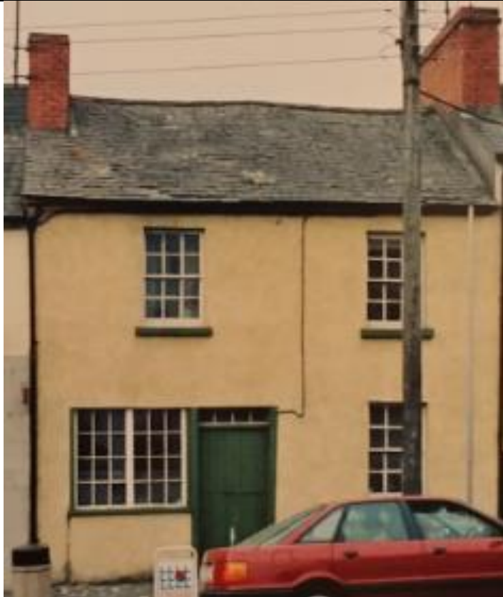
Hogans in the 1990's