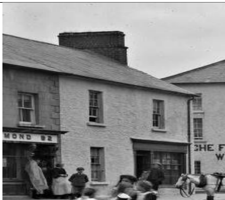
Early image of the shop