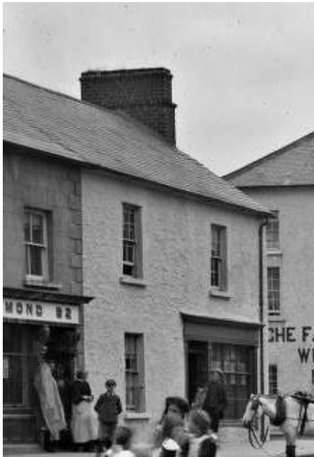
Early image of the shop in the 19 th century.