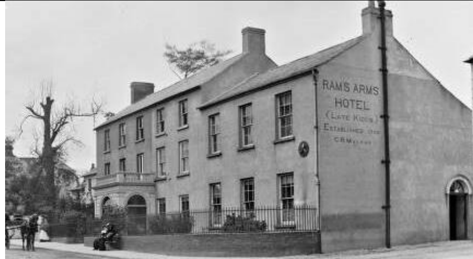
Rams Arms Hotel in its Hey Day at the turn of 20 th century