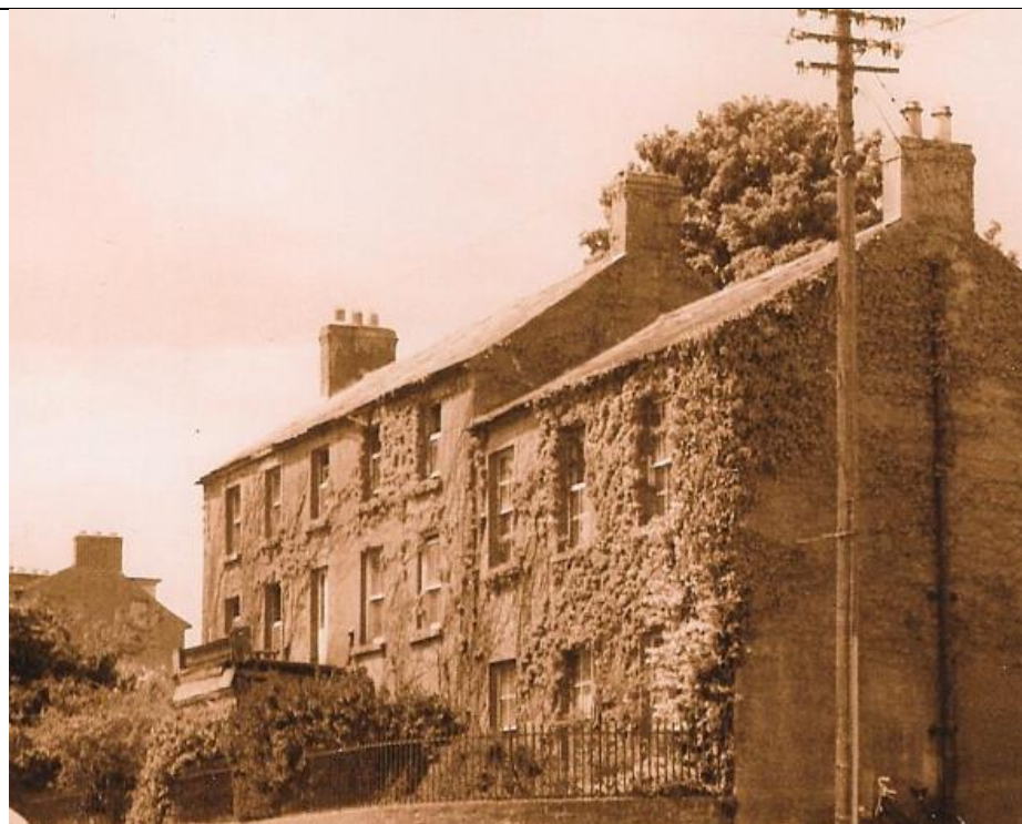
Rams Arms Hotel in the “not so hey days” prior to the demolition in 1977