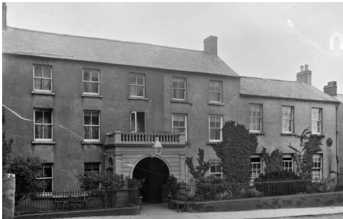
Image of the Rams Arms in the early years.

The contents of the property were auctioned off.