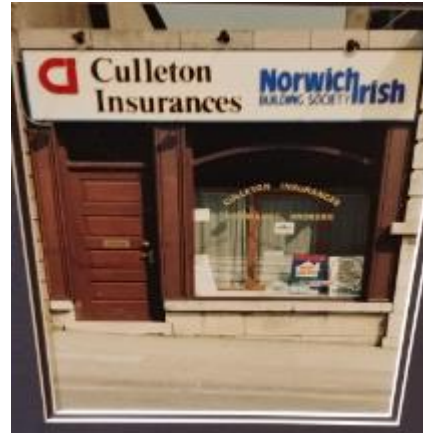
Culleton Insurnaces (Now Sorrento's Chip Shop occupies the former alley way space)