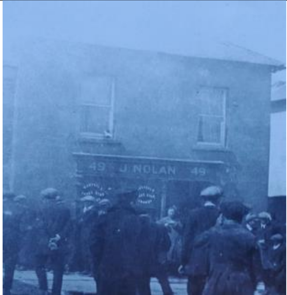
Image of property which stood on this site