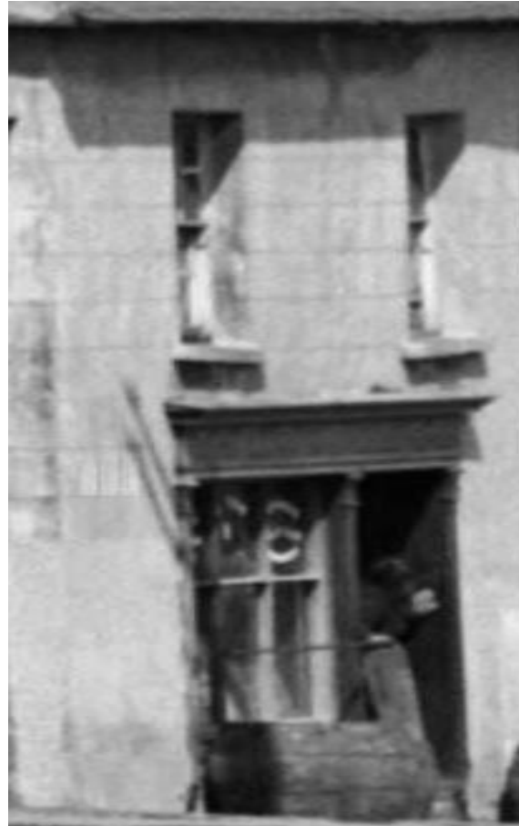
Images of No 49 Main Street Gorey; Note: Building no longer in existence.