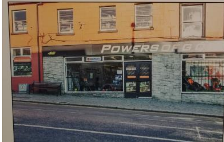
Olden Times and more modern times