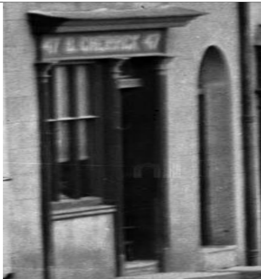
Cherricks who occupied No 47.