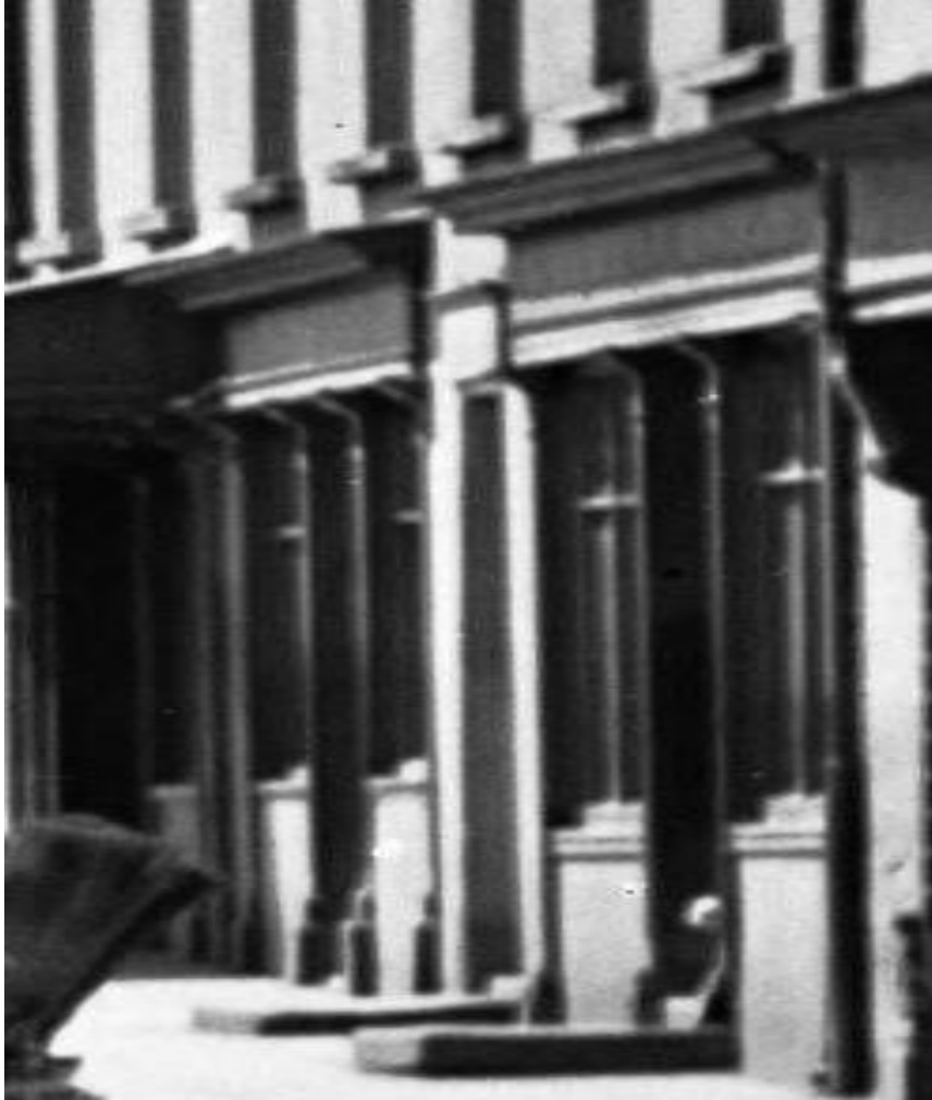
Image of No 39 and No 40 Main Street Gorey (Redmonds and MacReimonnns) in older times