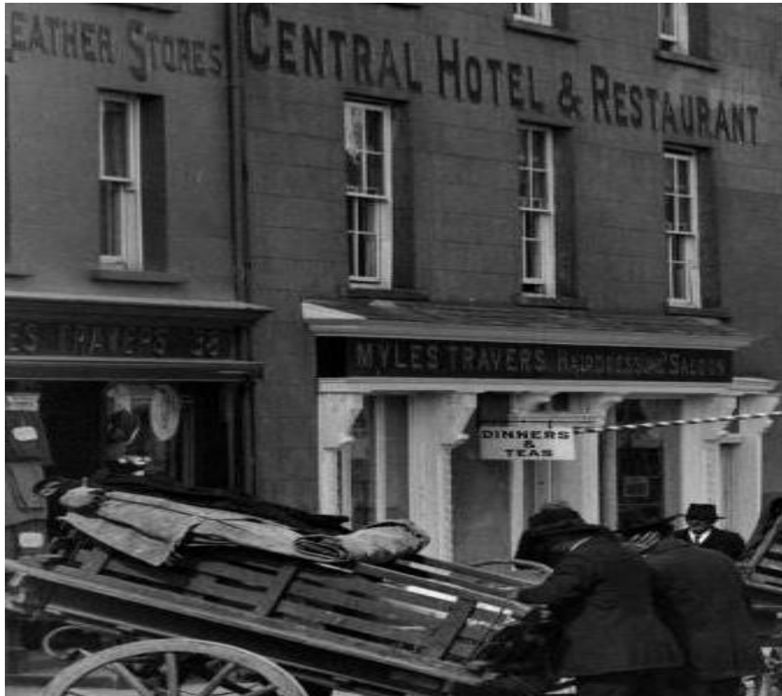
No 38 Travers Shop Main Street Gorey; on left hand side