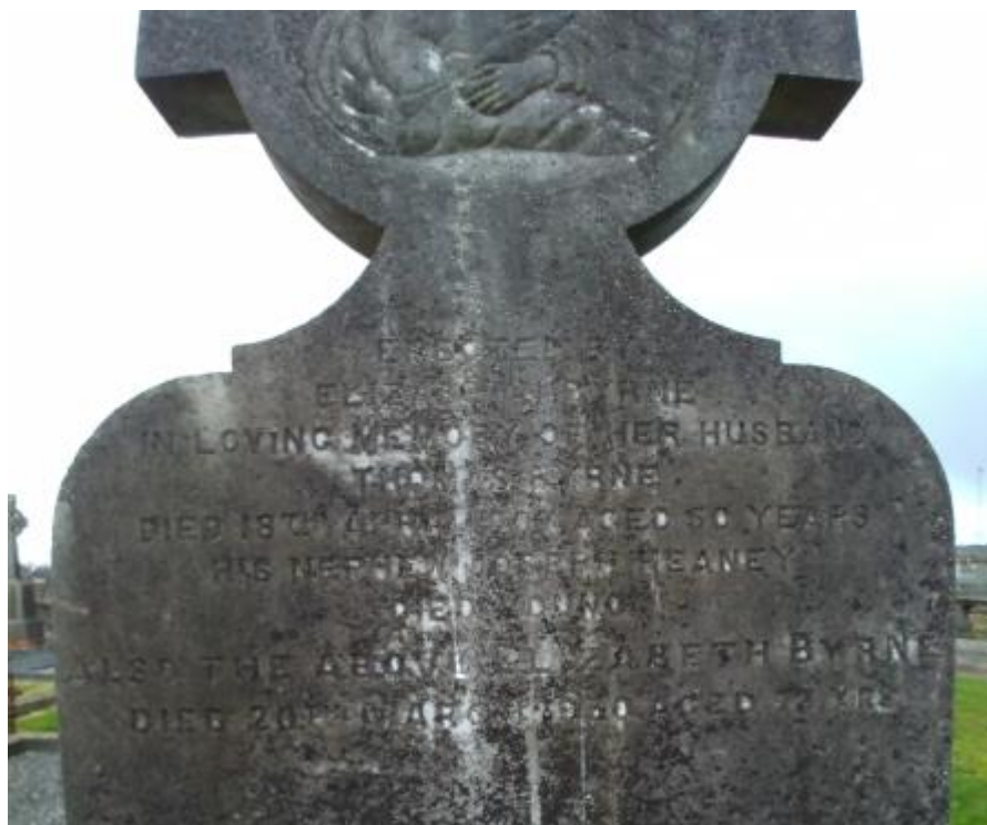
Headstone of the Byrne Family; Newsagent; No 36 Main Street Gorey and Church Street.