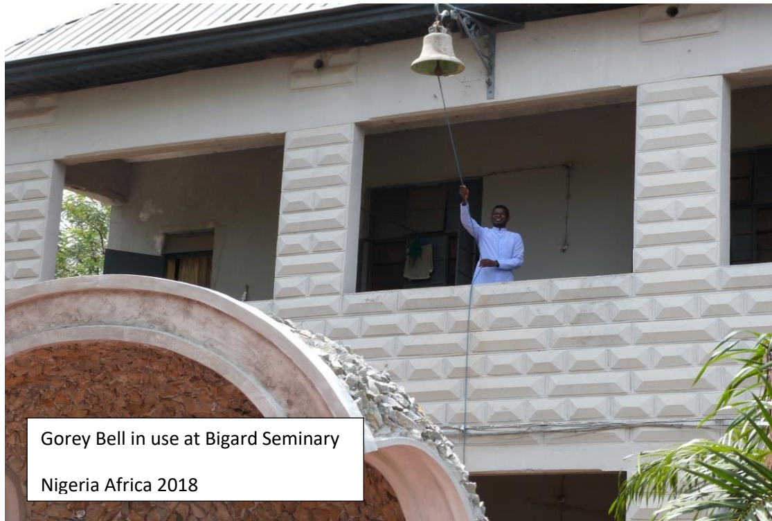
Gorey Bell in use at Bigard Seminary Nigeria Africa 2018