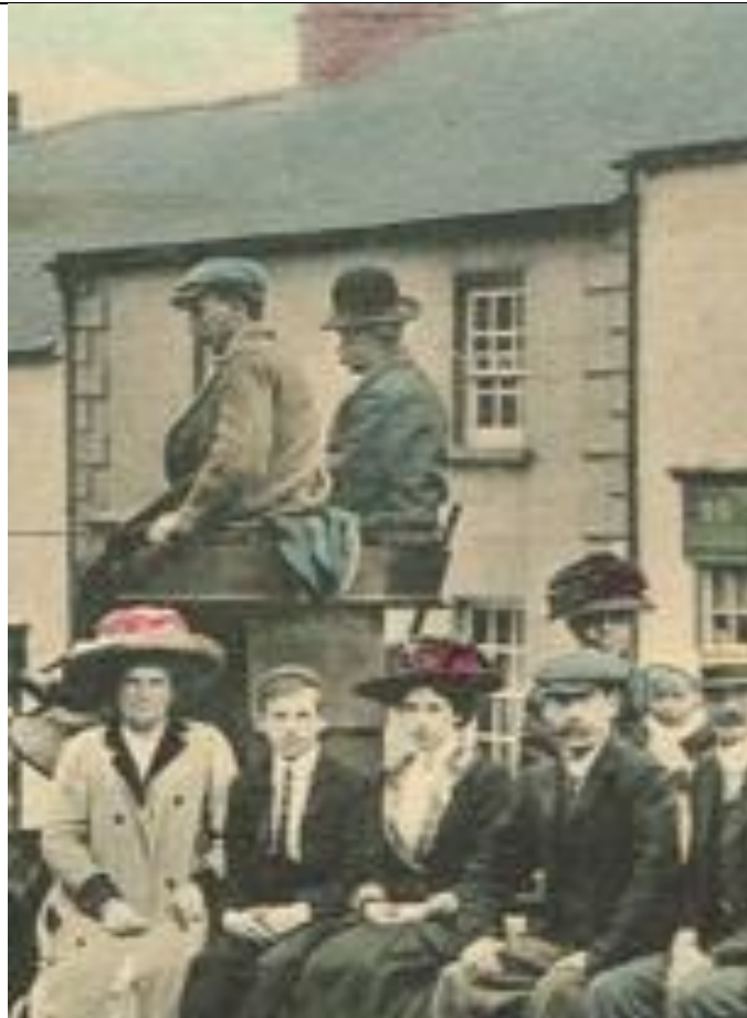
Image of No 100 behind the people in olden times