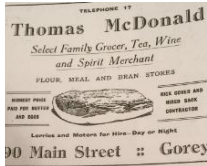
St Michael's Souvenir booklet McDonald Ad