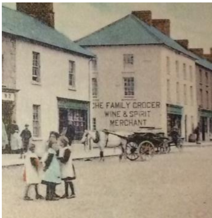
Gorey Main Street 1908 showing Roche Family Grocer & Wine & Spirit Merchant