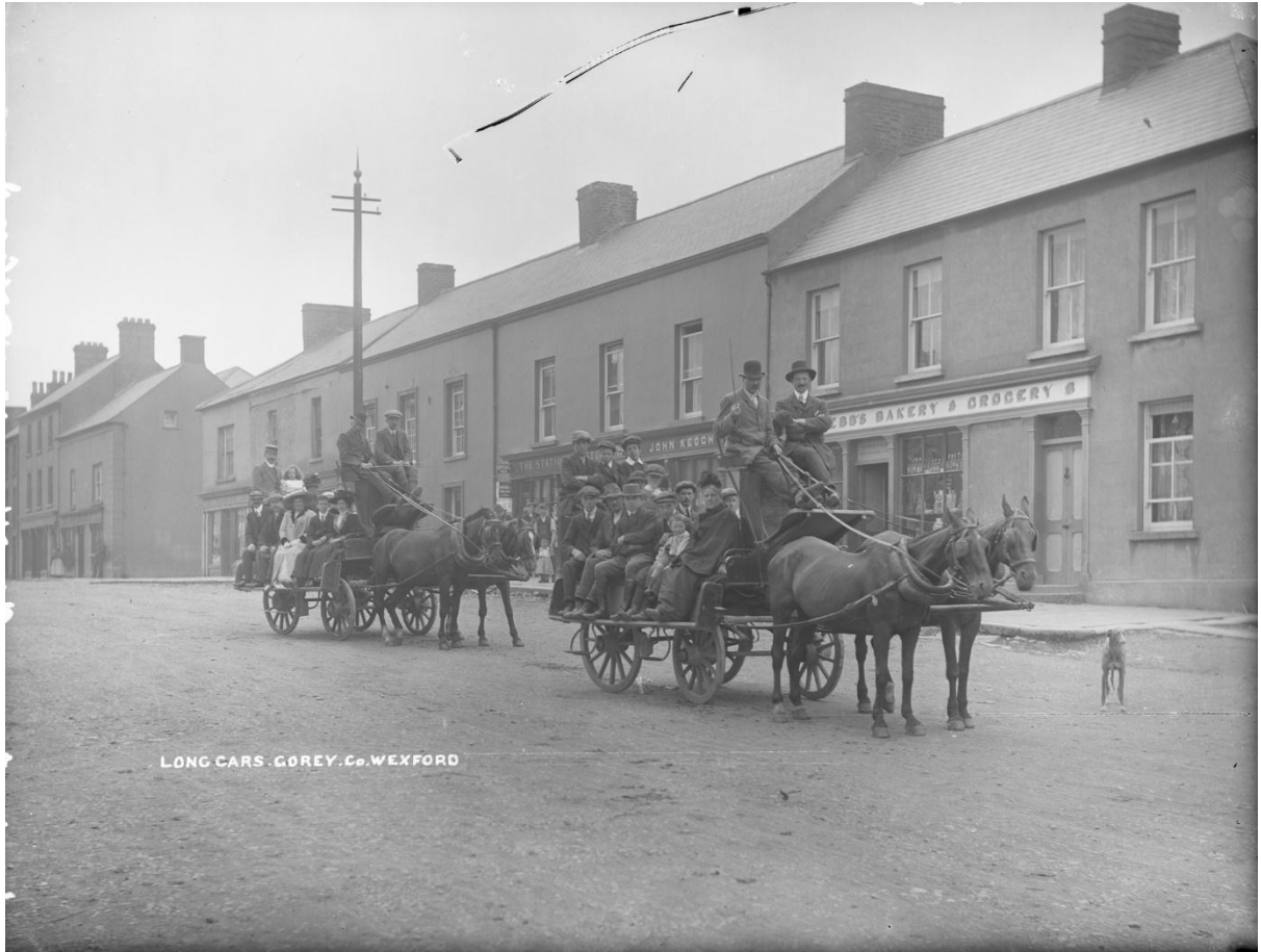
LONG CARS. GOREY. Co. WEXFORD