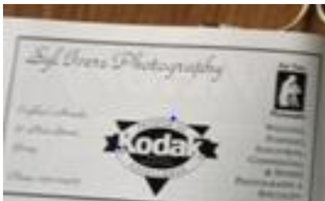
Image of Coghlan Cavanagh's shop 87 Main Street