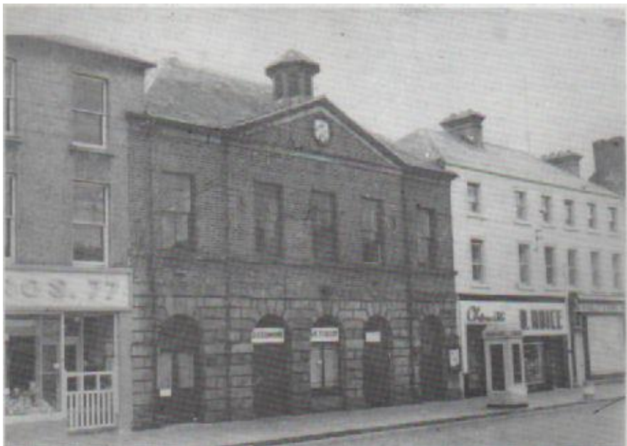
PHOTO: 77, CRYAN BROTHERS, MARKET HOUSE AND ROICES PHARMACY