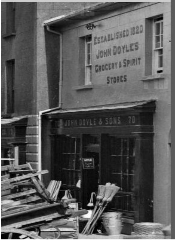
Sign says Established 1823