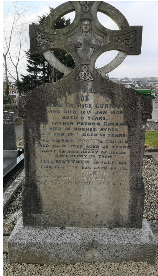
Curran Headstone St Michaels Gorey