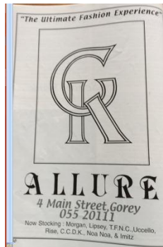
Ad from Gorey Community School Backchat 2000