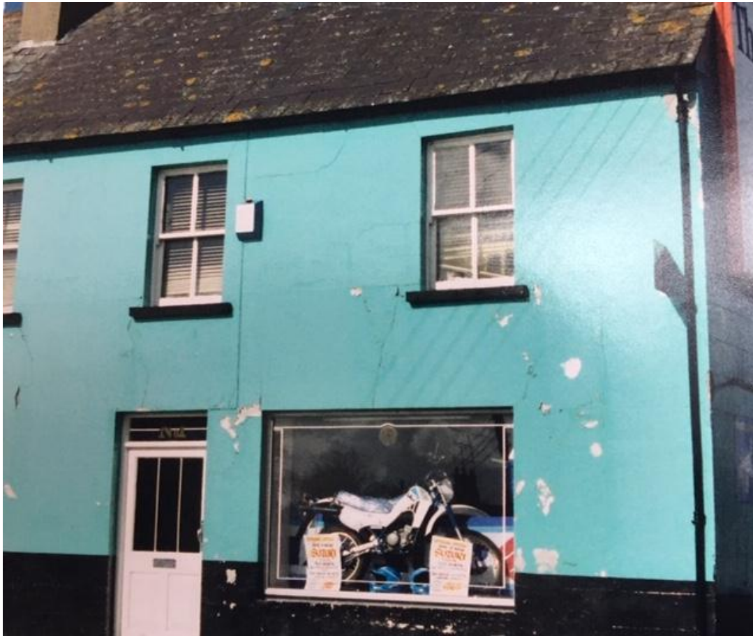
George James's Motorcycle Shop 1 Main Street Gorey courtesy Funge Collection 1987. The James family reside on the Old Dublin (Arklow) Road.