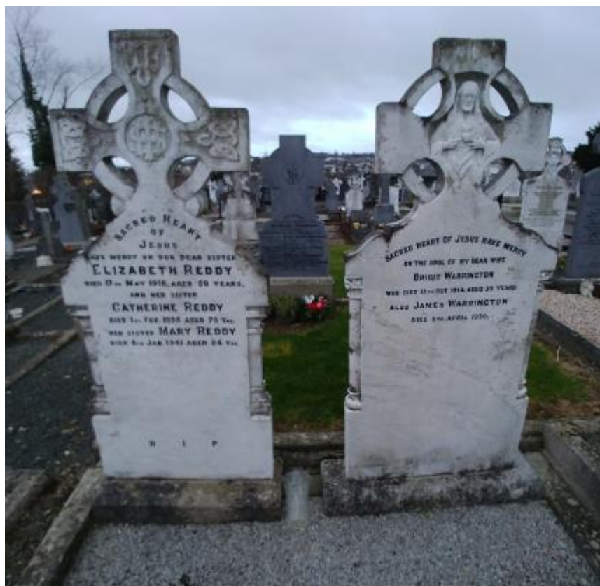
Family Headstone of Reddy and Warrington; St. Michael's Cemetery, Gorey.